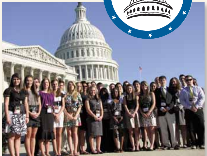
The 2011 North Carolina Youth Tourists